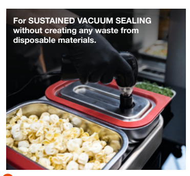
Our vaculid® lid system allows GN containers and thermoplates® to be vacuum-sealed, using either a hand pump or conventional vacuum chamber pumps. Food can be kept safely and longer in this way. This process retains virtually all the freshness, flavour and nutrients of food.

Ideal for the hygienic and standardised storage, keeping, transporting and serving of food. Robust and dishwasher-safe design. High and prominent offset stacking shoulders that only make contact at the corners, not only provide easy and space-saving stacking for good ventilation while stacked, but also define the filling height such that each GN container can be closed with a suitable lid from the range.