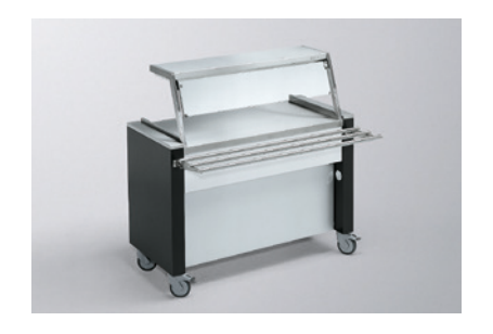
Rollito Universal (excl. attachments and decorative panel)

The Rollito makes a great impression thanks to its modularity and flexibility - whether hot, cold or neutral. Can be used anywhere where food is served. Each element in the Rollito series has been designed for its intended purpose from a purely functional point of view and can be used either individually or combined, and can be expanded at any time. Choose from 3 main body lengths. Each main body can be combined with various attachments. The attachments are not fixed in place and can be removed easily. More than 20 versions fulfill all requirements and can be integrated into any planning. Function bridges in the modules include proven and easy-to-use technology. The Rollito can be set up as free flow or in line, angled at 45° or 90°. Further configurations and modules (such as 'front cooking', beverages) and heights (750 mm for primary school catering) are available. Just ask us.