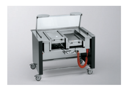
Rollito varithek® (excl. attachments and decorative panel)

Attachment available separately on request.