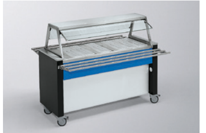
Rollito Cold with refrigerated well (excl. attachments and decorative panel)

Attachment available separately on request.